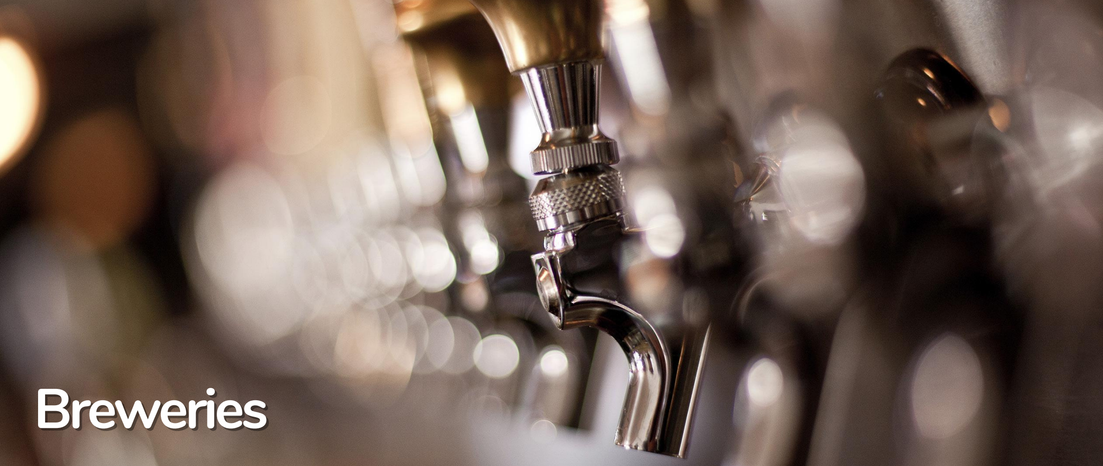
The Bend Ale Trail - Your Beer Adventure Begins In Bend, Oregon | www.visitbend.com/Bend_Oregon_Activities_Recreation/Bend-Ale-Trail